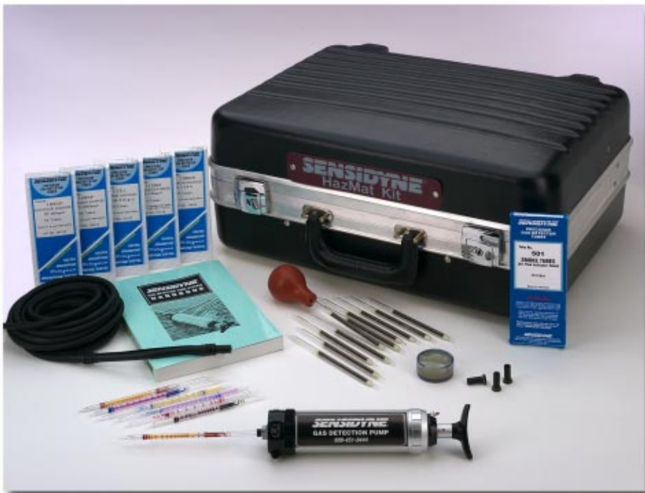
Deluxe Hazmat III Kit PN o 7013627

Using our unique absorbing media, the tubes have extremely clear lines of demarcation of the color stain. No filter paper or cumbersome reagents are required. This enhances reliability, reduces measurement time and increases accuracy. These are stable compounds, providing a long shelf life for most tubes, thus reducing inventory costs.