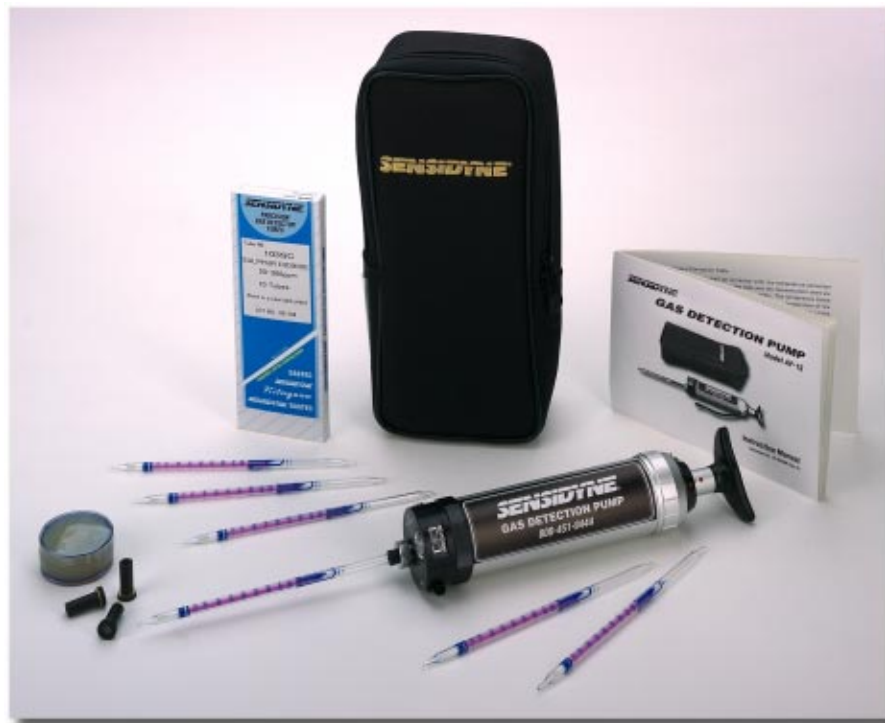
Model AP-1S Gas Detection Pump Kit PN o 7013585

It's safe, precise and fast. A Single Stroke of Genius.