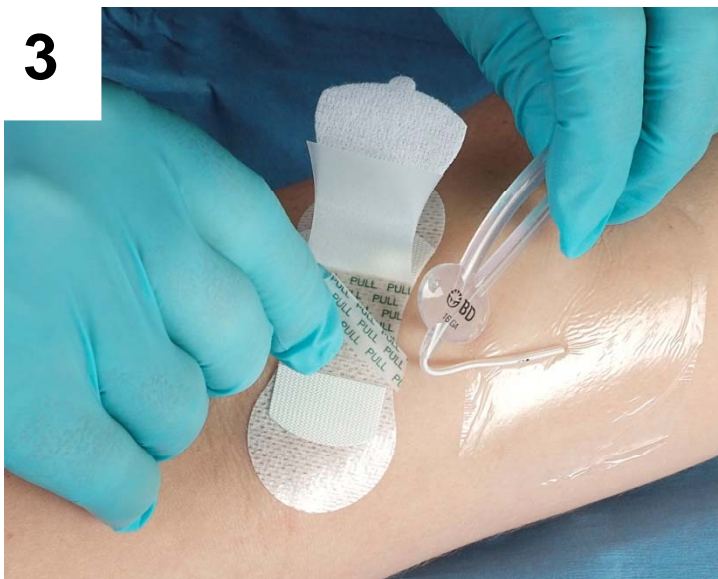
3 Remove the inside liner labeled PULL to expose the adhesive areas.