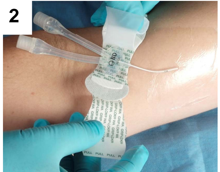
2 Pull the paper backing from one side of the Grip-Lok, then the other, to secure in desired position on the skin.