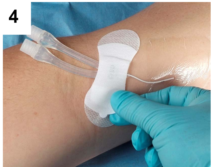
4 Place the catheter, tube or line on the bottom adhesive area and secure top flap over the catheter, tube or line.

Grip-Lok WA will secure a wide variety of catheter hub sizes and shapes.