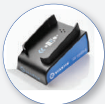
SB 104B-1 Docking Station for Single Dosimeter