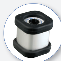
SV 34A Class 2 Acoustic Calibrator