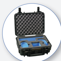
SA 147 Waterproof Carrying Case