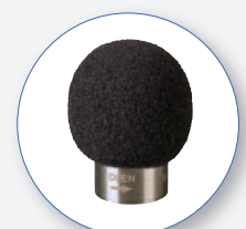
SA 122A Spare Windscreen