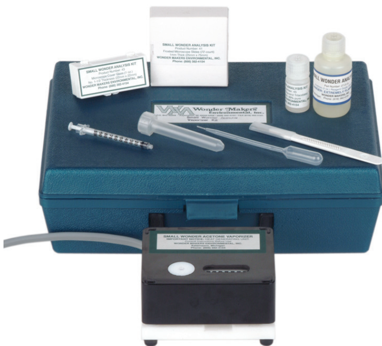
Complete Kit Shown Includes everything needed to clear slides for PCM analysis