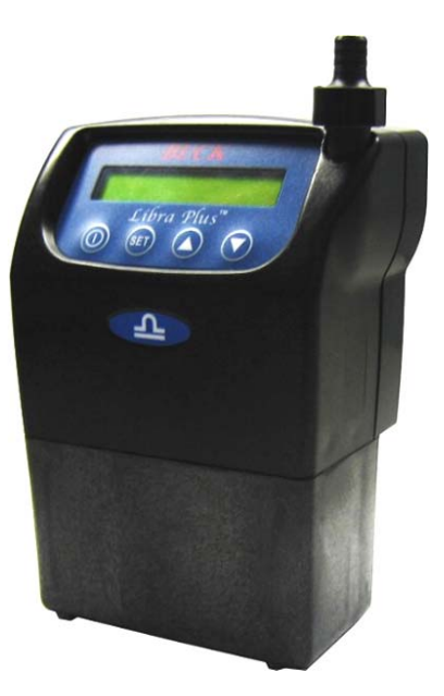
Powerful Personal Sampling Pump